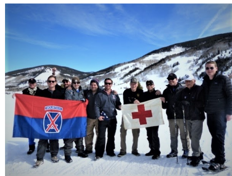
Veterans of the Triple Deuce Brigade, members of Huts for Vets and Vet Voices join Colorado Sen. Michael Bennet at Camp Hale in February