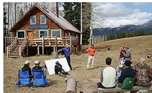
Summer Exploration Program at Harry Gates Hut

The program encourages the use of huts by educational nonprofits, promotes a better understanding and appreciation of the natural mountain environment and develops individual self-reliance among hut users. They assist nonprofits financially, and offer guidance in trip planning. Who can participate? Nonprofits with an educational emphasis such as schools,